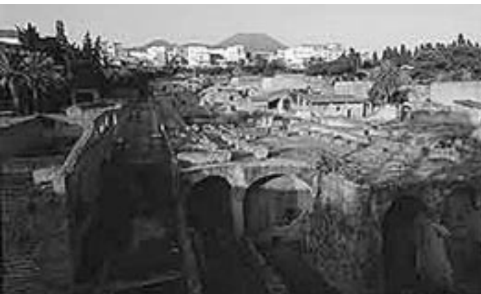
View of the city of Herculaneum